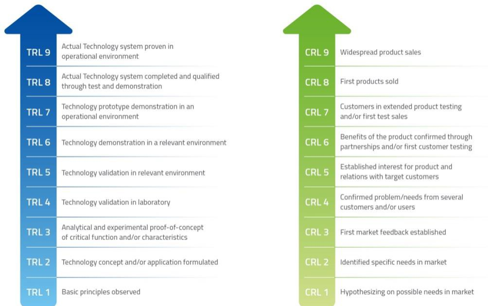
Figure 2 Technology Readiness Level (TRL) and Customer Readiness Level (CRL) graph